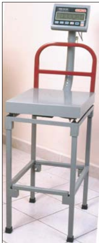
Enameled carbon steel table (29 inch) with lead free epoxy finish