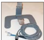
Remote module kit