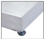
Stainless steel plate