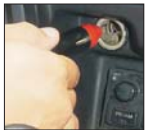
Car lighter adapter to plug in the scale